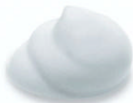
E-Z Foam Soap from one push